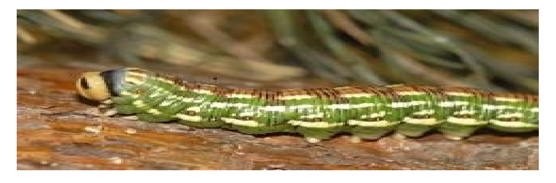
Pine processionary caterpillar